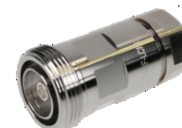
OMNI FIT™ Standard Connectors