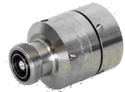
OMNI FIT™ Premium Connectors

The 7-16 connector is the most rugged RF connection meeting all requirements even under the most severe environmental conditions. Sealing against outer conductor and jacket by means of O-Ring and 360° compression fit. Multifunctional, self-lubricating HighTech polymer assembly locks on cable corrugation, avoids electrochemical potential differences and compression-fits to the jacket.